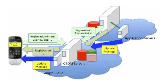
Figure 2. The Android Cloud To Device Messaging Framework (C2DM)Overview

The application servers can initiate communication (push method instead of pull) with their own mobile applications. Then data can be exchanged, updated and/or queued for installation. The C2DM handles queuing of messages and delivery to its client Android mobile application. Therefore, C2DM is the most efficient way for the application server and its client Android mobile application to communicate. This is also the most efficient way to notify the user of new application updates. It is still the user who must approve or grant the application update Figure 2 illustrates the C2DM service mechanism. The structure consists of three components, which are Google C2DM servers, Application Server and Android applications. The Application Server sends messages to the Google C2DM servers with an HTTP POST, whenever the server wants to communicate with its Android application.